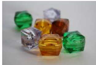
Cube with facets