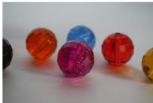
Ball with facets